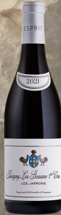
Savigny Les Beaune Rouge 1er Cru Les Jarrons 2021