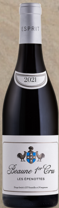
Beaune 1er Cru Les Epenottes 2021