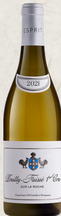
Pouilly-Fuisse 1er Cru Sur la Roche 2021