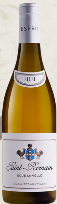
Saint Romain Sous la Velle 2021